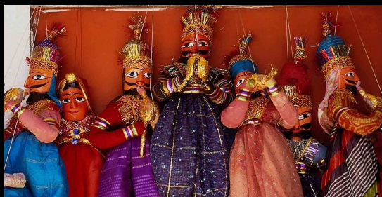
VODORAVNA USMERITEV podprta s formatom