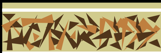
VODORAVNA (horizontalna) USMERITEV podprta z formatom.