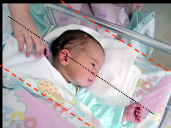
POŠEVNA (diagonalna) USMERITEV