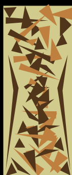
NAVPIČNA (vertikalna) USMERITEV podprta z formatom.