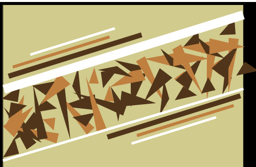
POŠEVNA (diagonalna) USMERITEV